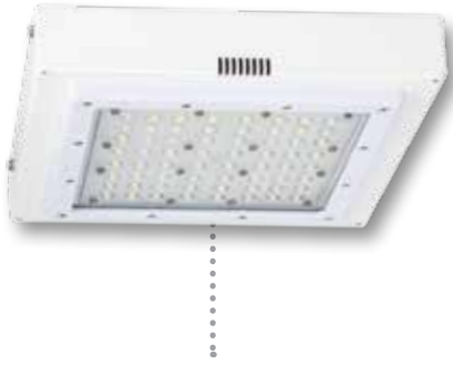
12"D x 12"W x 2.375"H Weight: 7.5 lbs.

Applications: Security, entryway and perimeter lighting. Also recommended for parking garages, shopping area walkways, and exterior canopies Typical Mounting Height: 8 to 15 feet Typical Spacing: 1 to 2 times the mounting height