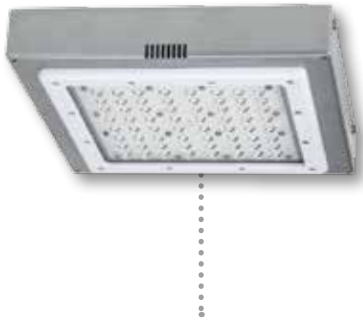
12"D x 12"W x 2.375"H Weight: 7.5 lbs.

Applications: Security, entryway and perimeter lighting. Also recommended for parking garages, shopping area walkways, and exterior canopies Typical Mounting Height: 8 to 15 feet Typical Spacing: 1 to 2 times the mounting height