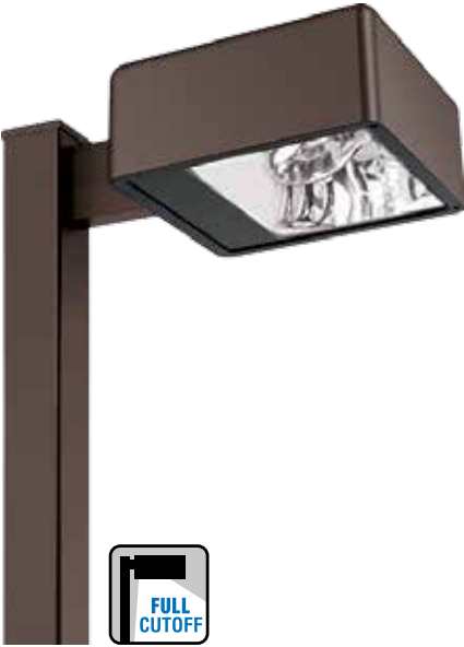
Shown with 6" arm

Applications: Roadway, parking areas or for building-mounted security lighting Typical Mounting Height: 15 to 30 feet Typical Spacing: 3 to 5 times the mounting height