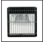
Wire Guard CAT.# E-ACWG12 -12" Housing CAT.# E-ACWG16 -16" Housing