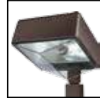
Polycarbonate Vandal Shield CAT.# E-ACLS12 -12" Housing CAT.# E-ACLS16 -16" Housing CAT.# E-ACLS22 -22" Housing