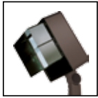
Deep Baffle CAT.# E-ACDB12 -12" Housing CAT.# E-ACDB16 -16" Housing