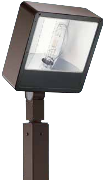
Shown with 2" adjustable fitter

Applications: Roadway, parking areas or for building-mounted security lighting Typical Mounting Height: 15 to 30 feet Typical Spacing: 3 to 5 times the mounting height