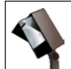
Glare Shield CAT.# E-ACGS12 -12" Housing CAT.# E-ACGS16 -16" Housing