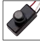
Button Photocell (For 2" Fitter) CAT.# E-ACP1 -120V CAT.# E-ACP2 - 208/240/277V