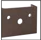
Wood Pole Mounting Bracket (For use with yoke mount) CAT.# E-ACWPMBM