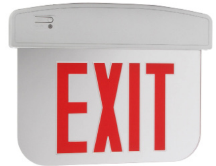
Shown with Red Letters