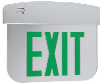
Shown with Green Letters

Our UL listed LED Edgelit Exit Sign with Battery Backup is available in green and red letters and features an easy-snap mounting canopy for quick top, end, or back mounting. Enjoy a 5-year limited warranty and a battery backup.